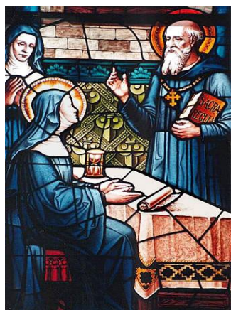
Stained Glass, first Chapel, St. Joseph Monastery, St. Marys, Pennsylvania.